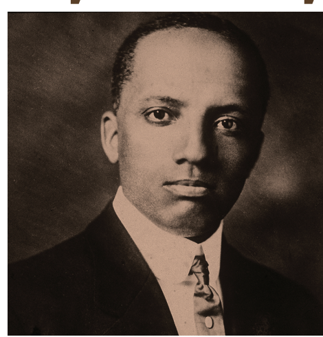
He told an audience of Hampton Institute students, "We are going back to that beautiful history and it is going to inspire us to greater achievements." In 1925, he decided that the association had to shoulder the responsibility. Going forward, it would

He hoped that others would popularize the findings that he and other Black intellectuals would publish in The Journal of Negro History , which he established in 1916. As early as 1920, Woodson urged Black civic organizations to promote the achievements that researchers were uncovering. A graduate member of Omega Psi Phi, he urged his fraternity brothers to take up the work. In 1924, they responded with the creation of Negro History and Literature Week, which they renamed Negro Achievement Week. Their outreach was significant, but Woodson desired greater impact.